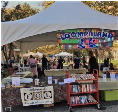
Friends table at Book Festival